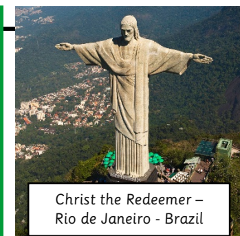
Christ the Redeemer – Rio de Janeiro - Brazil