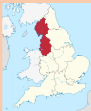
The North West of England