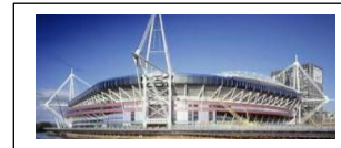
The Principality Stadium