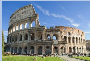
The Colosseum in Rome