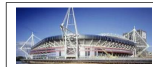
The Principality Stadium