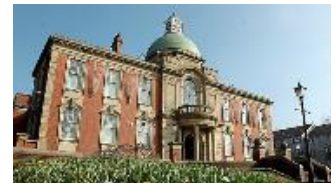
Chadderton Town Hall