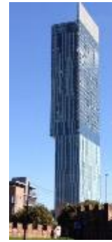
The Hilton Hotel