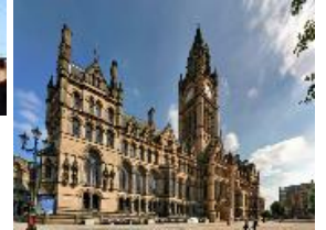
Manchester Town Hall