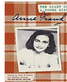
Diary of a Young Girl