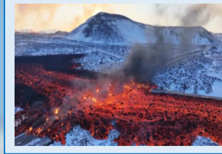
A volcano erupting in Iceland.