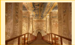
The Valley of the Kings