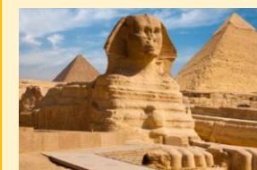
The Great Pyramids and Sphinx of Giza