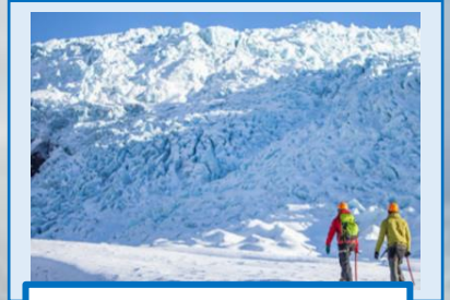
A glacier in Iceland.