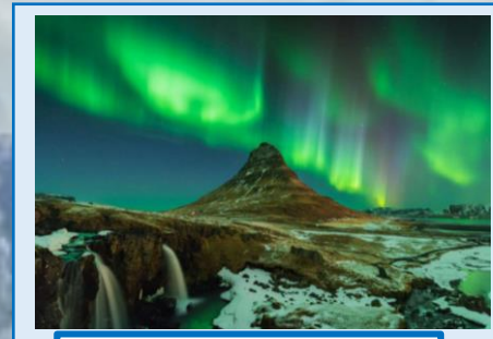
The Northern Lights – Aurora Borealis