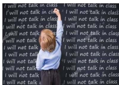
If children were caught talking, they had to write lines.