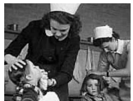
Nurses checking children's hair and teeth.