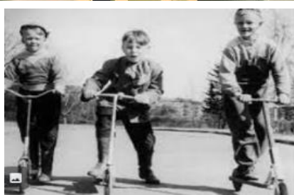
Children riding scooters.