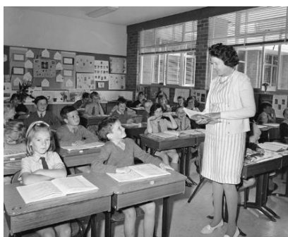
A classroom in the past.