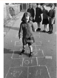
Children playing hopscotch.