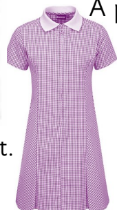
A purple summer dress or shorts.