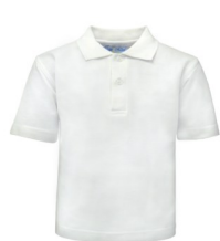
A white polo shirt or shirt.