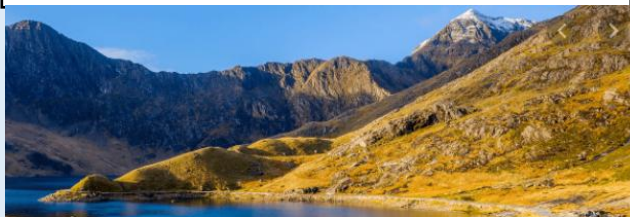
This is Snowdon (1085m). It is the highest mountain in Wales and is found in Snowdonia National Park.