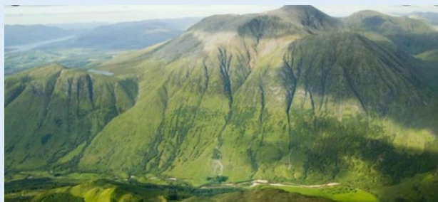
This is Ben Nevis (1345m). It is the highest mountain in the UK. It is part of the Grampian Mountains in Scotland.