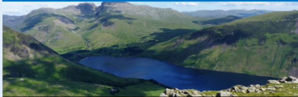
This is Scafell Pike (978m). It is the highest mountain in England and is in the Lake District National Park. It is part of the Southern Fells Mountain range in Cumbria.

A mountain is a landmass that has a naturally occurring elevation. Mountains are usually taller and steeper than hills. A hill is usually anything under 300m high and a mountain anything over 300m. Mountains normally reach to a pointed peak or a summit whereas hills generally have more rounded peaks.